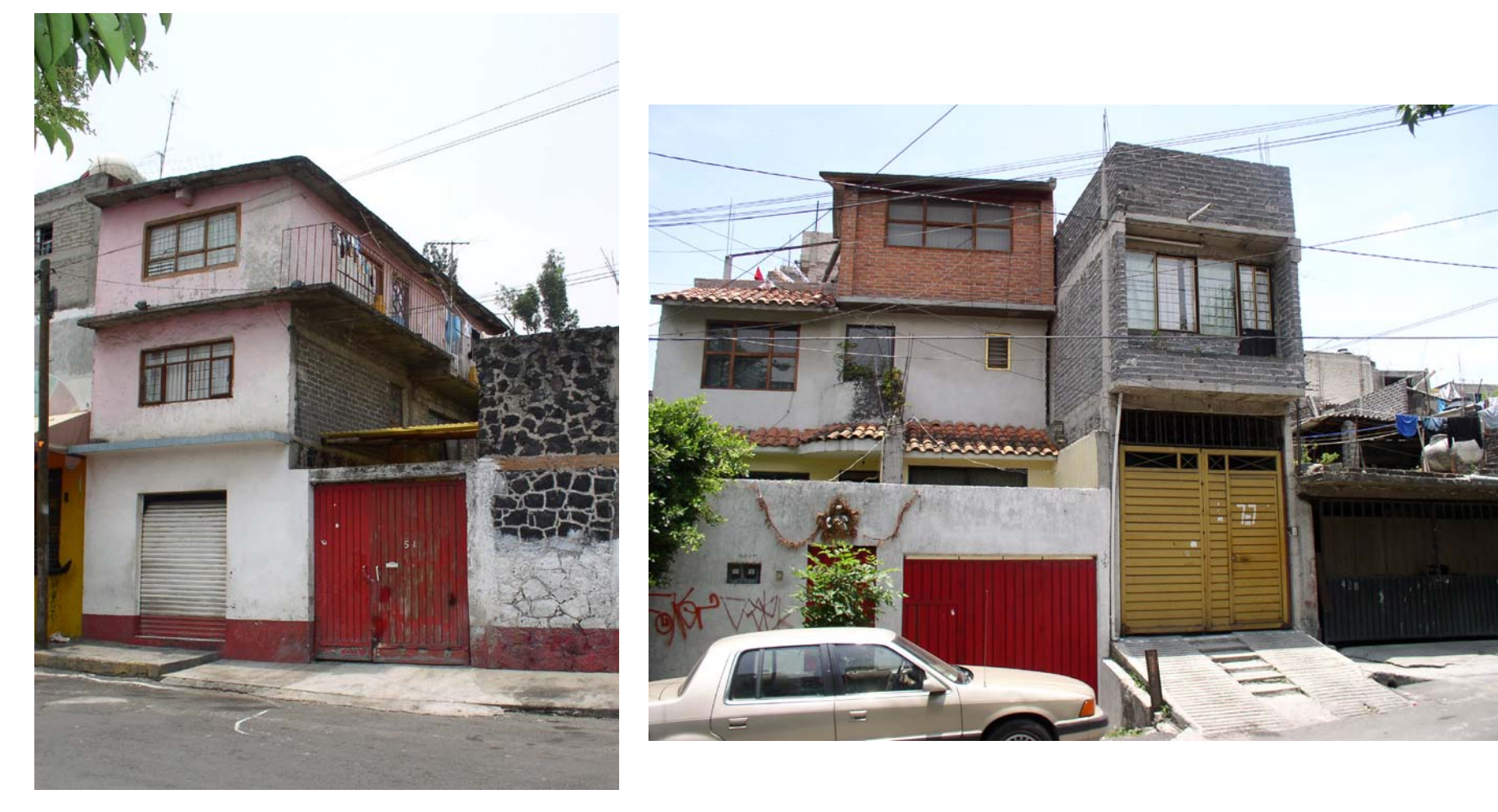
Figure 1c shows the same 3 story dwelling (from Figs. 1a & 1b) in close up. Figure 1d shows how lots may be divided (between 2 kin related families [note double electricity meters on the left hand home]); while part of next door's lot has been sold off as a separate dwelling (garage door & entrance with rooms above).